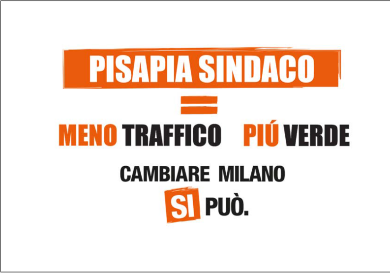
Figure A2 – Opponent’s Campaign Slogan, Negative Tone