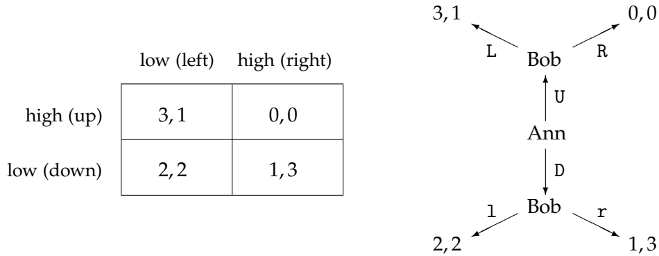
Figure 1: The Stackelberg mini-game.

Consider a quantity-setting duopoly where each of two firms, Ann and Bob, can choose either a low quantity or a high quantity, and Ann moves first. The extensive form of the game and the payoffs associated to the various combinations of outputs are given in Figure 1. Note that the backward-induction path is the Stackelberg sequence (U,L).